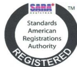
President, SARA Registrar