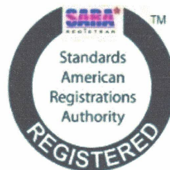
President, SARA Registrar